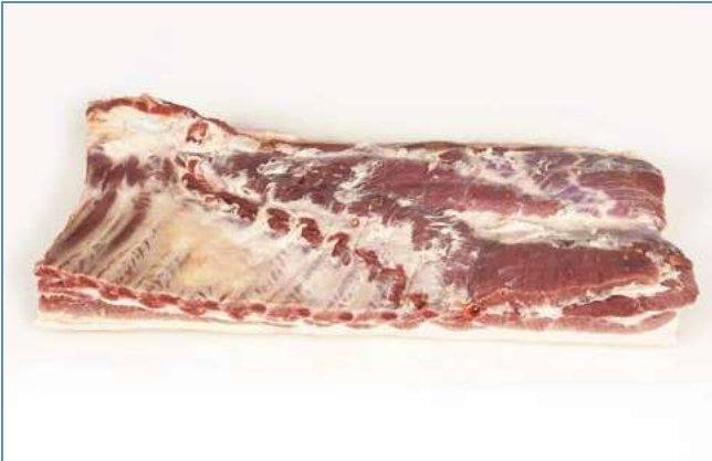
1 Bone-in Belly.