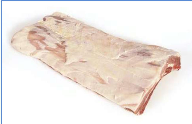
2 Remove rind from the belly.