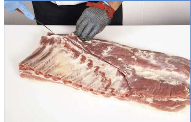
3 Remove breast bone (sternum) and expose rib cartilage.