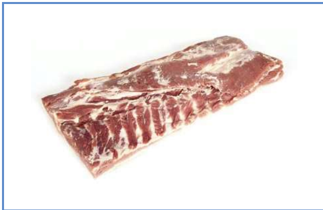
5 Belly – boneless, rindless.