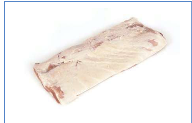
6 Belly – boneless, rindless.